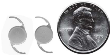
Figure 2: Size comparison of two TECNIS® Symphony Extended Range of Vision IOL model types and U.S. penny

The most common treatment for cataract today is to remove the clouded natural lens. It is then replaced with an artificial lens. This artificial lens is called an intraocular lens (IOL). Figure 2 below compares the size of a TECNIS® Symphony Extended Range of Vision IOL to a U.S. penny.